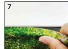
7 Insert silicon edge fabric into frame groove