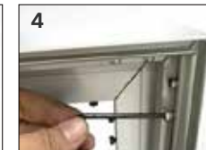
4 Fit off with allen head screw