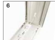
6 Connect LED lights with plug & play connectors