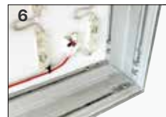
6 Attach the LEDs to the back of the frame