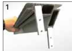
1 Insert corner bracket