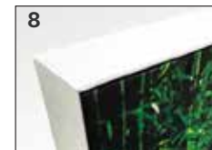
8 Finished product