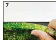
7 Insert silicon edge fabric into frame groove