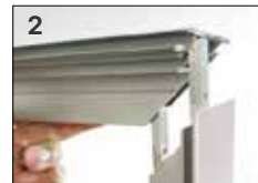
2 Assemble each corner