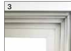
3 Check Angle for 90 degrees