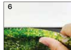
6 Insert silicon edge fabric into frame groove