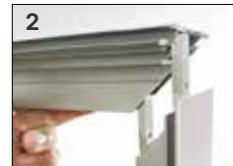
2 Assemble each corner