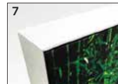
7 Finished product