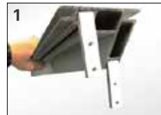
1 Insert corner bracket