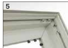
5 To each corner