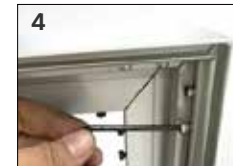
4 Fit off with allen head screw