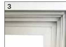
3 Check Angle for 90 degrees