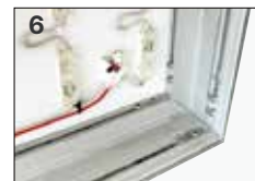
6 Attach the LEDs to the back of the frame