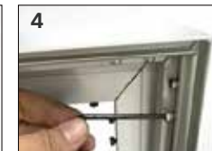
4 Fit off with allen head screw