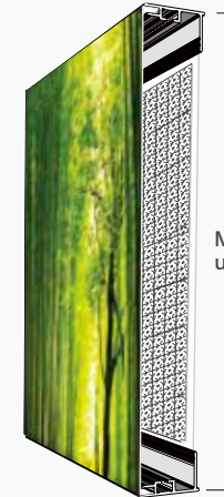
Max Height up to 1,500mm