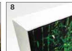
8 Finished product