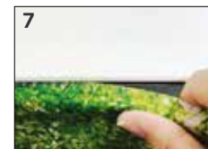
7 Insert silicone edge fabric into frame groove